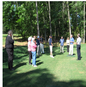
Official Opening of the New Driving Range

We offer a restful retreat from today's world and a stirring mix of scenic beauty. Carolina Hills at Meadowbrook provides a true sense of community combined with an activity-centered lifestyle that will appeal to your entire family!